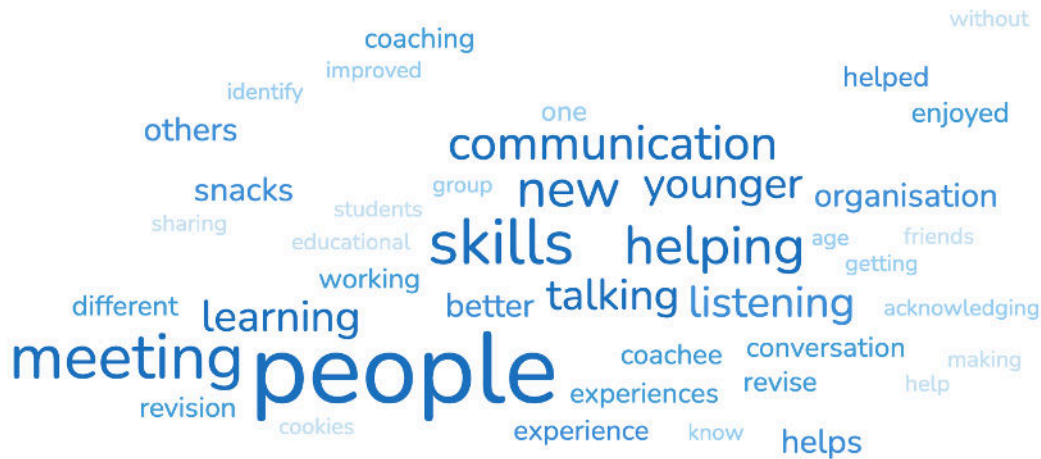
Wordcloud from feedback of our Academic Coaching Programme

A summary of partnership activity for schools in the OX14 learning partnership.