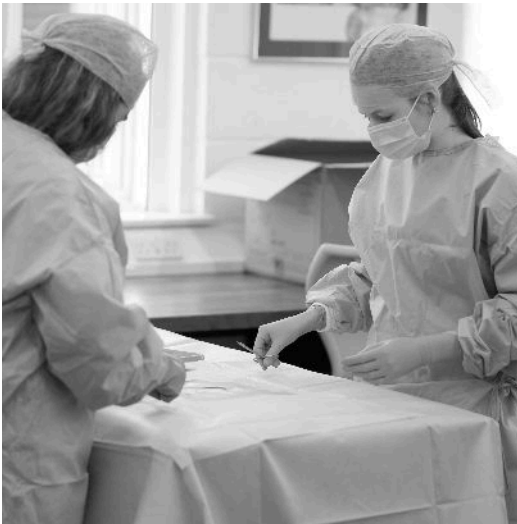
Medic taster Day

Aspiring medics enjoyed an action packed day of practical workshops and gained insight into what it takes to be a medical professional. This isn't Going to hurt, hosted by Radley College, allowed students to learn from experts in a host of medical fields and take part in real life scenarios. From ward rounds to sutures, bleep calls and using a back board, students were inspired to challenge themselves as they took part. This exciting day was a hit with all those who took part and we hope it has motivated them to continue on their journey into medicine.